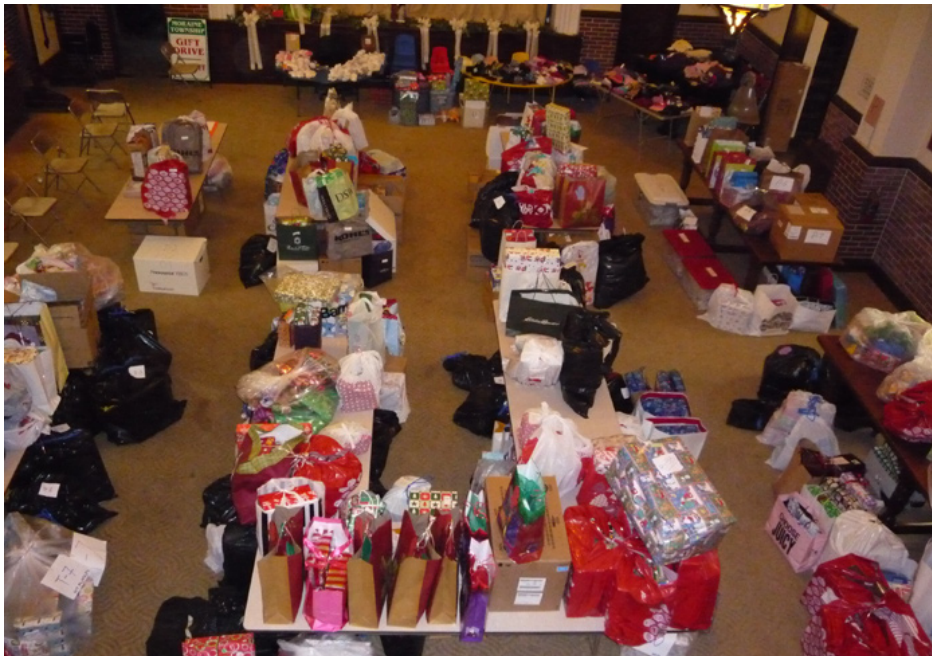
Bird’s eye view of some of the Santullano Holiday Gifts ready for pick-up December 18 & 19

“With one year under our belts, we learned to have a children’s resource room where they could safely wait – meeting Santa! – while their parents picked up donated gifts. We again enjoyed the services of many generous volunteers in this activity, especially from our